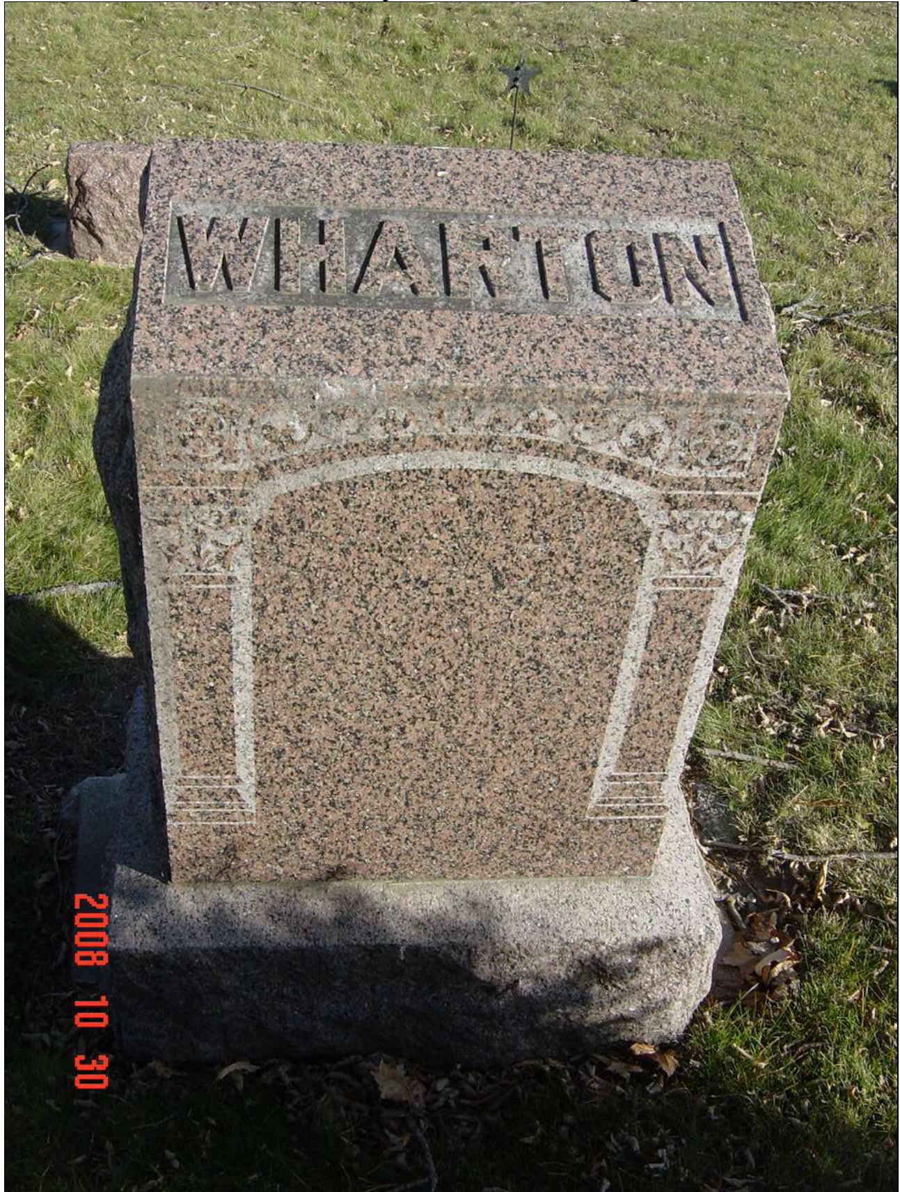
WHARTON FAMILY MARKER