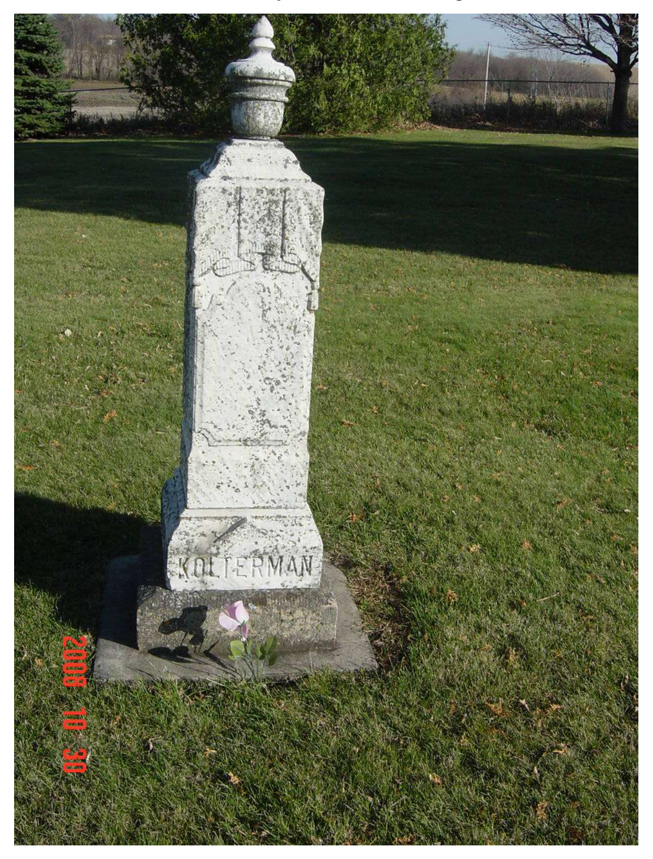
KOLTERMAN FAMILY MARKER