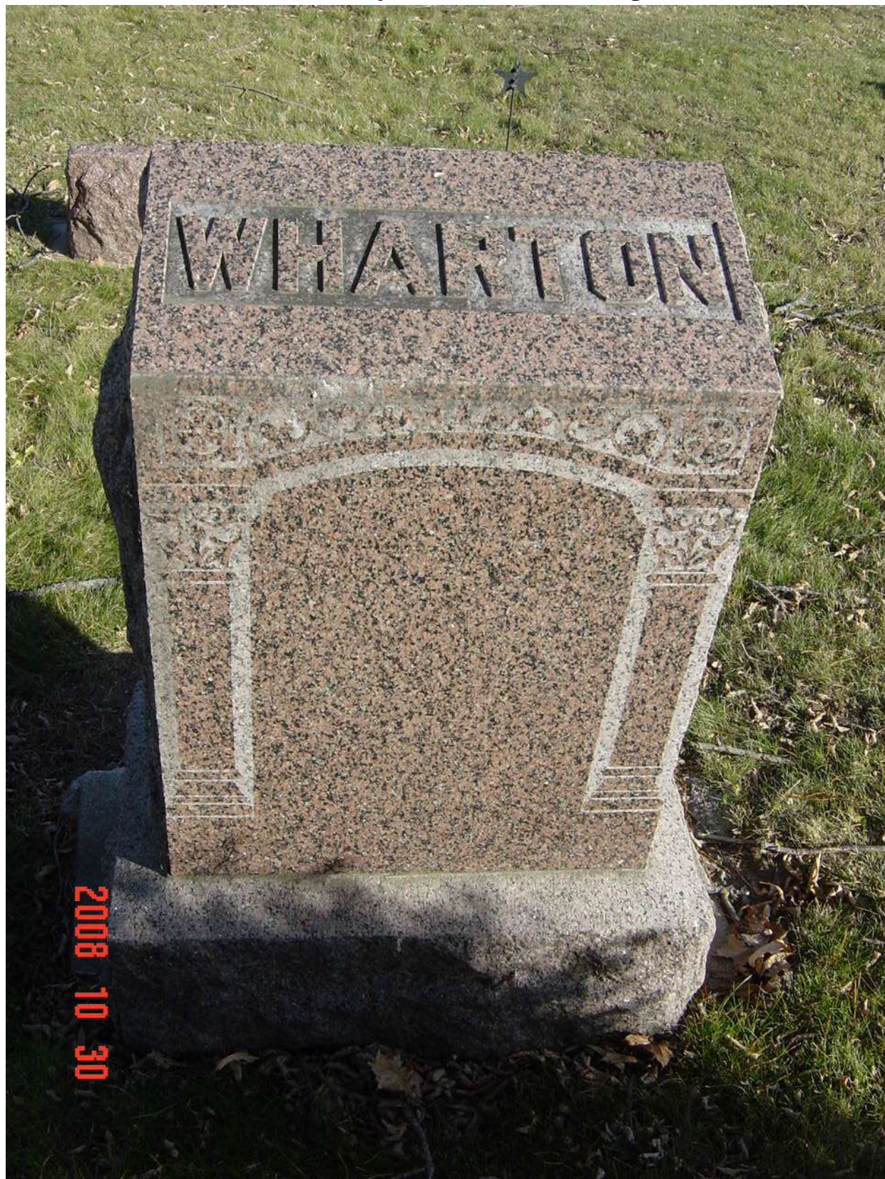
WHARTON FAMILY MARKER