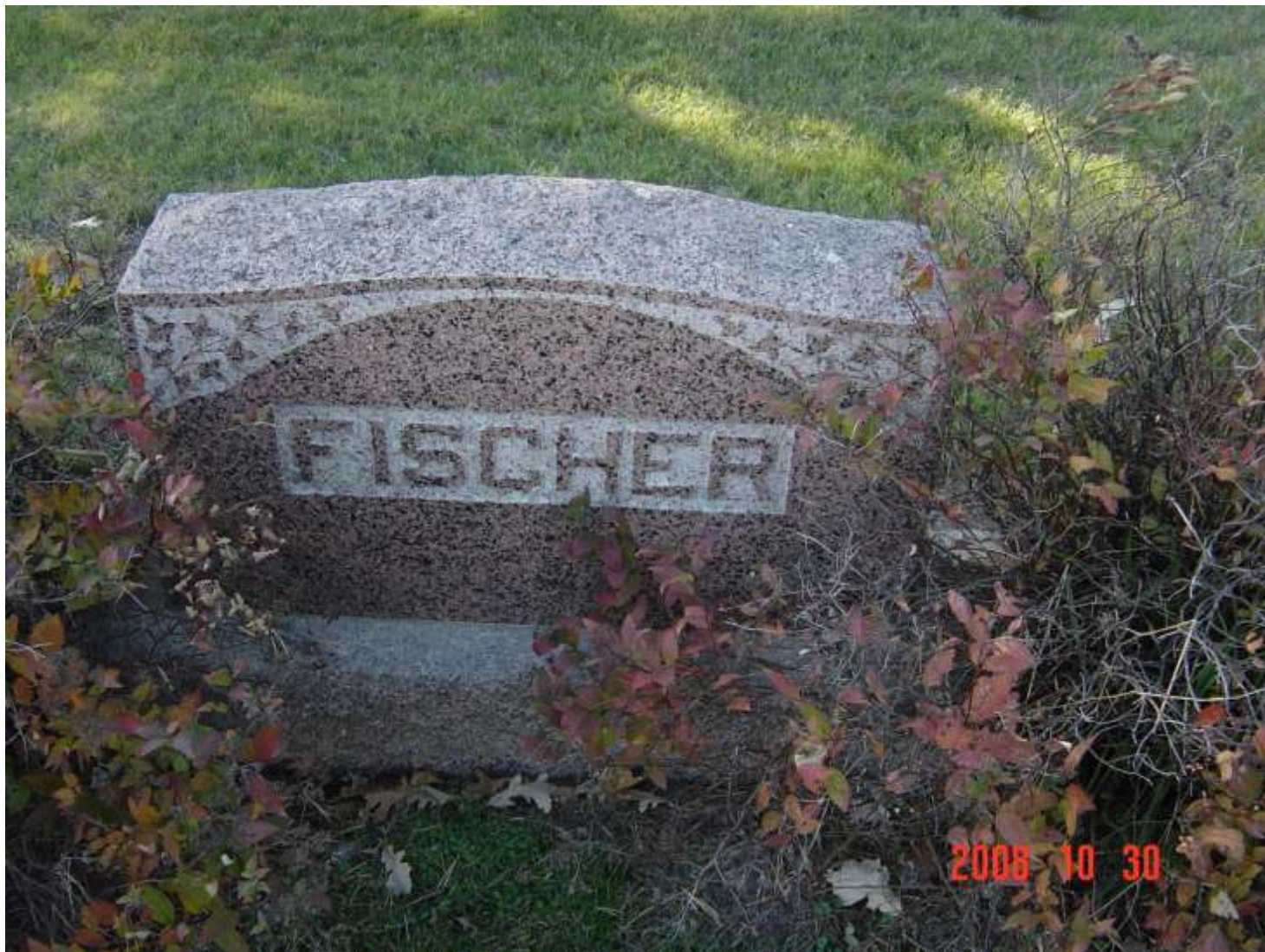
FISCHER FAMILY MARKER