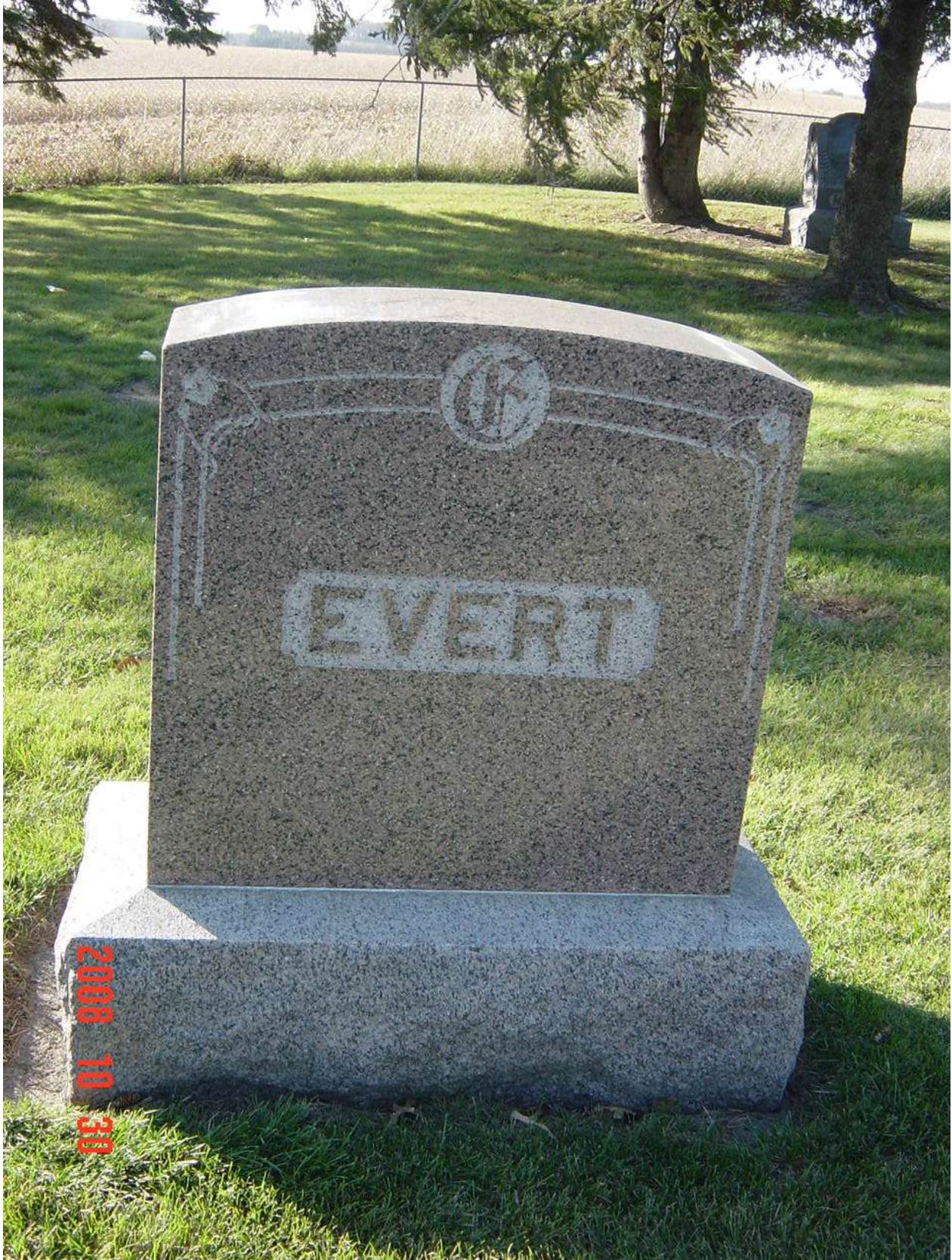
EVERT FAMILY MARKER