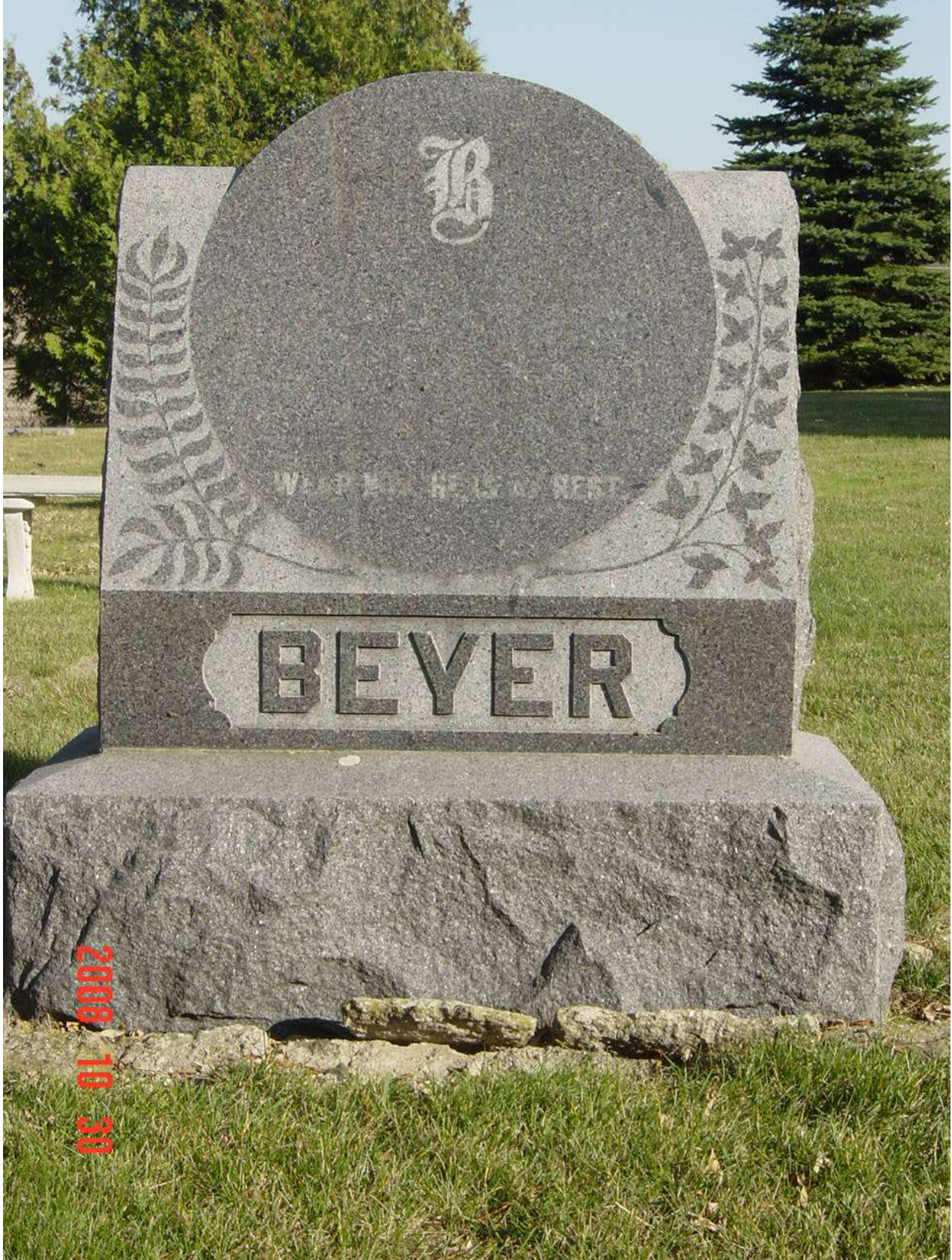
BEYER FAMILY MARKER